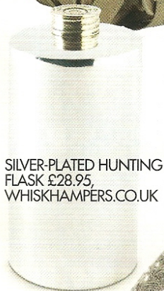
SILVER-PLATED HUNTING FLASK £28.95 WHISKHAMPERS.CO.UK