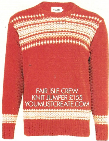
FAIR ISLE CREW KNIT JUMPER £155 YOU MUST CREATE.COM