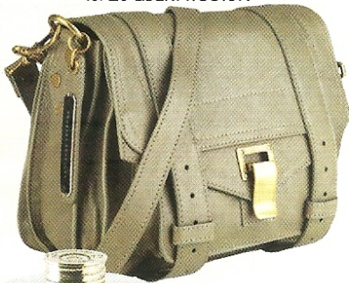
GREY PS1 POUCH LEATHER SATCHEL BAG BY PROENZA SCHOUER £920 LIBERTY.CO.UK